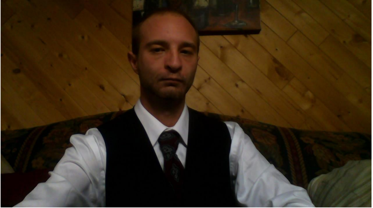
HRH King Adhaimh I Ó hEideain of Dôn, Caer Noddfa